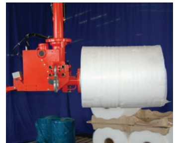
Expanding mandrel end-effector handling rolls of paper.