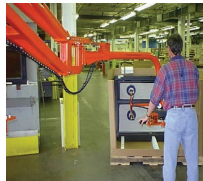
Pedestal mounted WM with vacuum end-effector loading product into boxes.