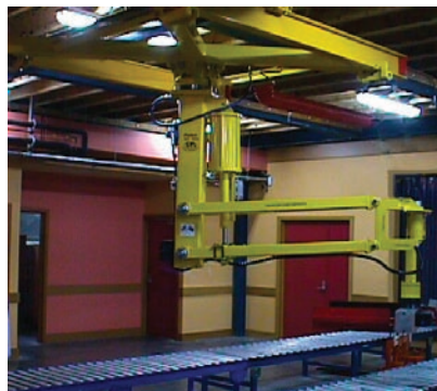
Trolley mounted WM used for servicing work cells with low headroom.