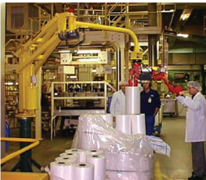
Pedestal mounted WM with ID gripper used for handling rolls of paper.