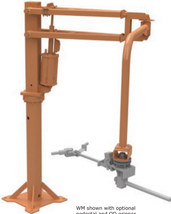
WM shown with optional pedestal and OD gripper end-effector.

Positech's pneumatic World Manipulator® (WM) is a low headroom solution for maneuvering payloads up to 1,000 pounds, providing rigid support and reach-in capability. This ergonomic lift assist can be used as an alternative to a sling and hoist or a forklift to improve safety, functionality and performance.