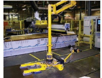
Vacuum end-effector handling parts in the assembly process.