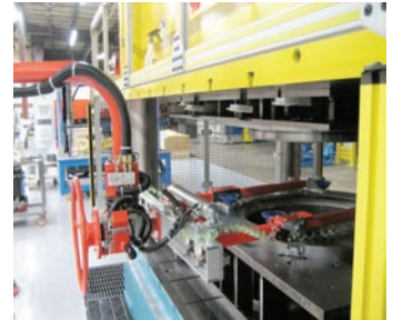
OD gripper end-effector loads and unloads parts from press.